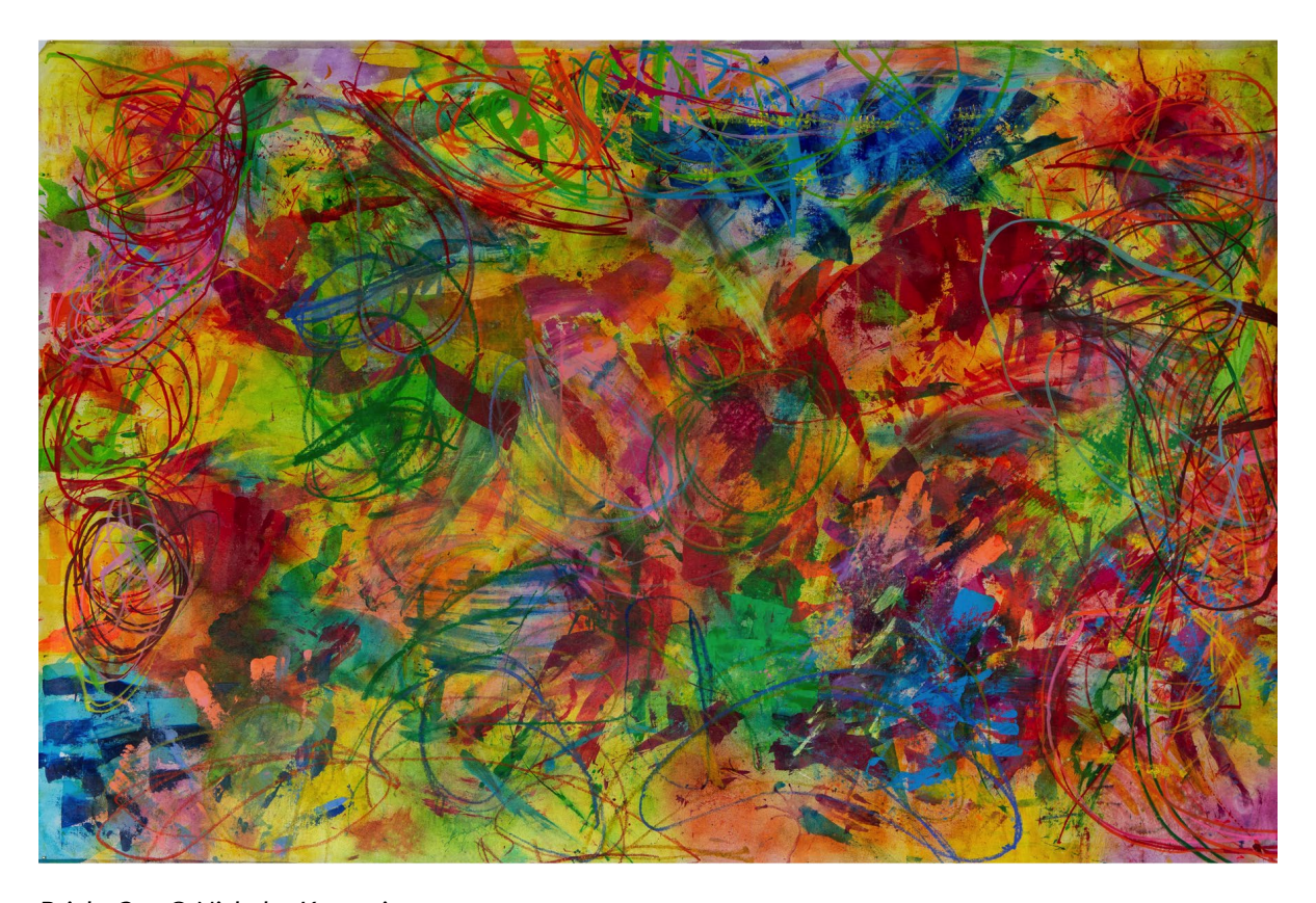
Bright One