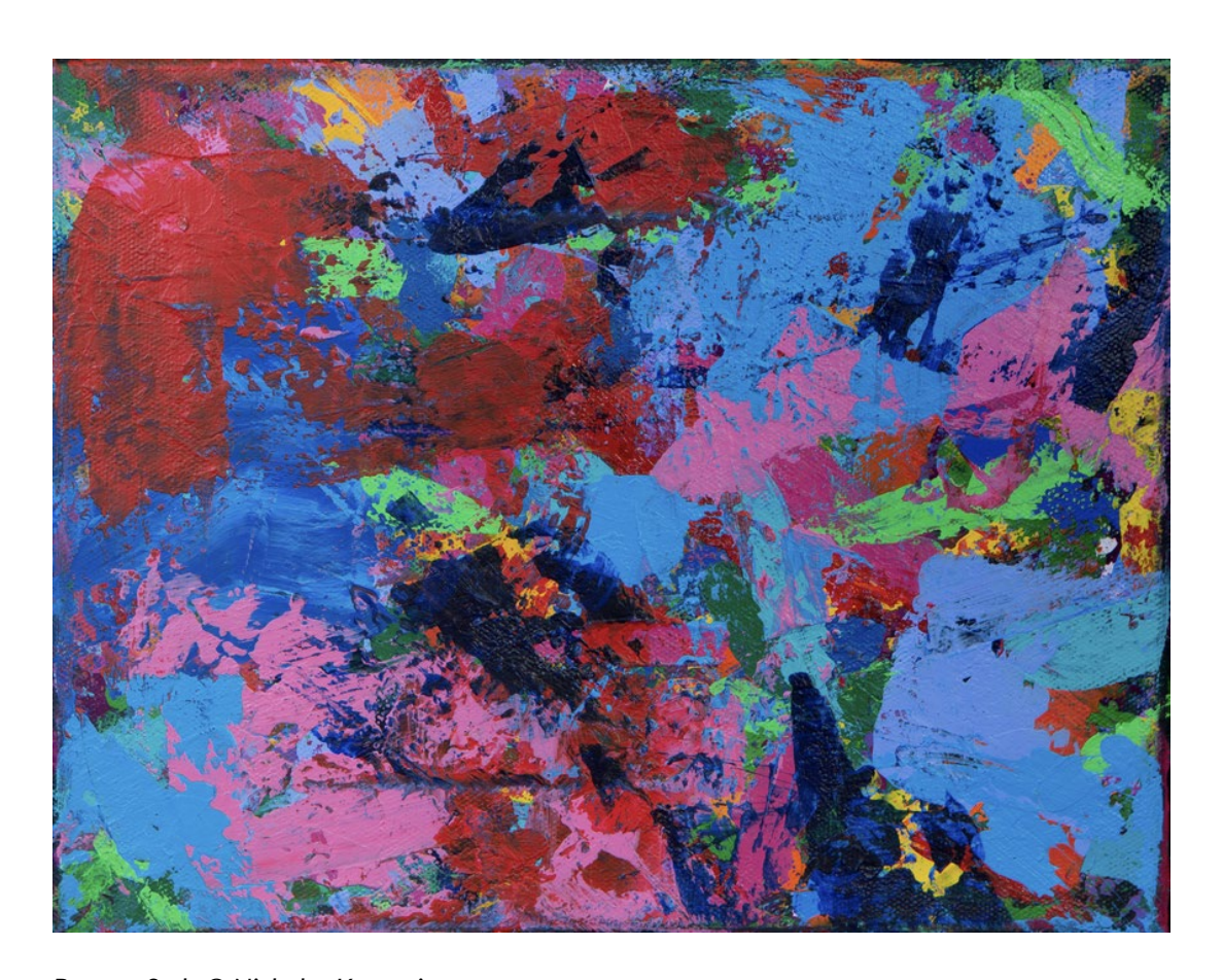
Banana Style